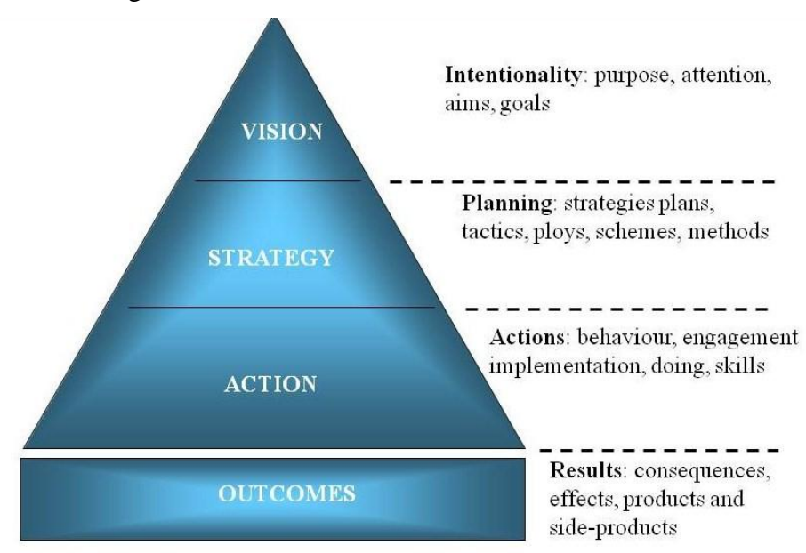
Figure 2. The Four Territories of Experience

The second tool of Action Inquiry is called the Four Territories of Experience. Covering all four territories across all three Perspectives of Knowing ensures that our thinking is comprehensive. A description of the Four Territories is shown in Figure 2.