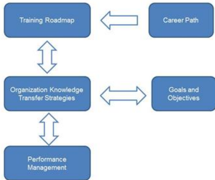
Figure 3: Generic Model