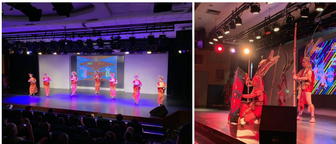
Figure 4: Images of cultural performances inside MaTiC's auditorium