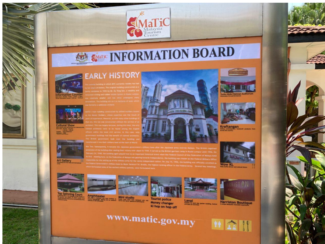
Figure 3: Information board at the entrance of MaTiC