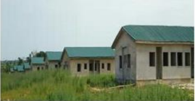
Talba Housing Estate Minna comprises of 500 Housing Units (2&3 Bedroom Flat) completed