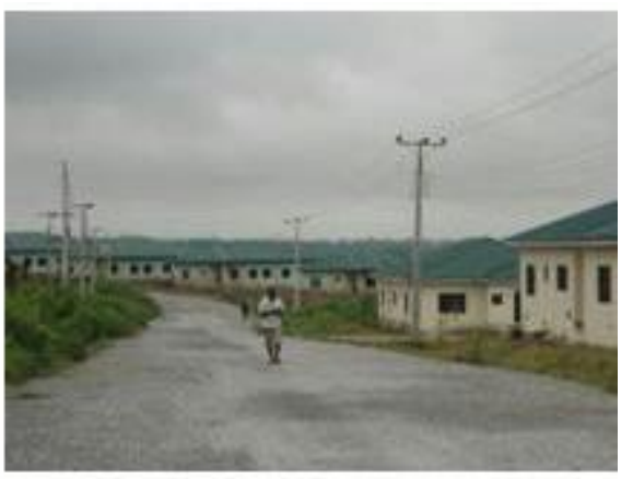
Aliyu Makama Housing Estate Bida comprises of 150 Housing Units (2&3 Bedroom Flat)