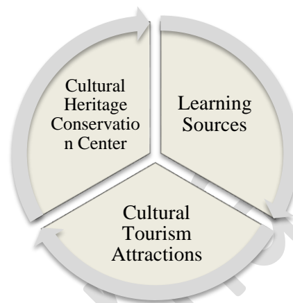
Figure 2. National Museum Development Concept

Inside of each national museum in Bangkok are also different departments in regard to operation and management being administration division, security division, exhibition gallery keys division, and academic division. The management strategies are development plans implemented by the Office of National Museums with an emphasis on socio-cultural, academic and economic aspects of the national museums to serve as both learning sources and tourism attractions (Figure 2. National Museum Development Concept).