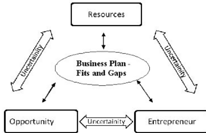
Figure 1: Three driving forces

Source: Based on Jeffry Timmons' framework, as presented in Jeffry A. Timmons, New Venture Creation (Homewood, IL: Richard D. Irwin, 1990)