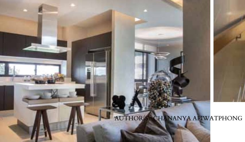
DESIGN LITERACY / LIVING COMFORT AND LUXURY IN SMALL SPACE