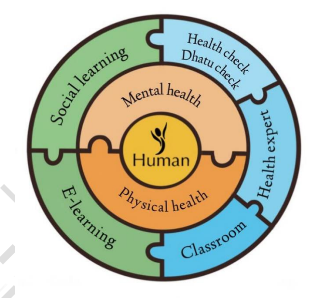
Figure 1: Integrated Learning Concept (ILC)

To answer the 1<sup>st</sup> research question, the figure of Integrated Learning Concept was illustrated. From figure 1, holistically, the human is the focal point of the concept. ILC has six key components and all components are elaborately designed to enhance the state of wellness of the human. ILC vitally has six interrelated components and each component is interlocked like a jigsaw puzzle, missing one piece cannot make a complete image. It is very much like the concept of holistic health, where the whole is greater than the sum of its parts. Each component cannot be regarded as inseparable view.